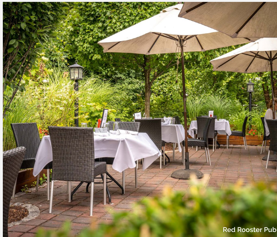
Red Rooster Pub